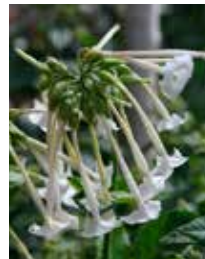
Nicotiana glauca syvestris