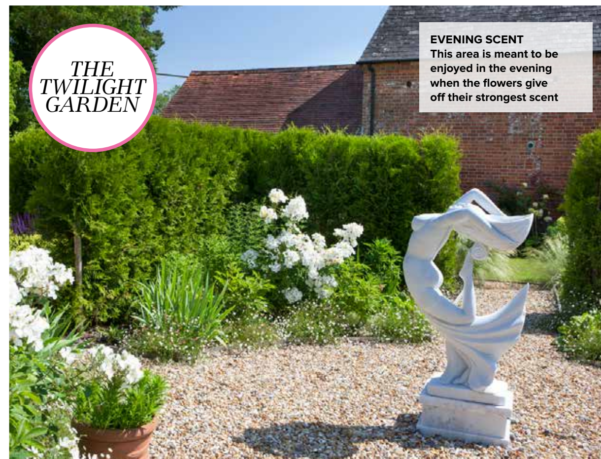
EVENING SCENT This area is meant to be enjoyed in the evening when the flowers give off their strongest scent