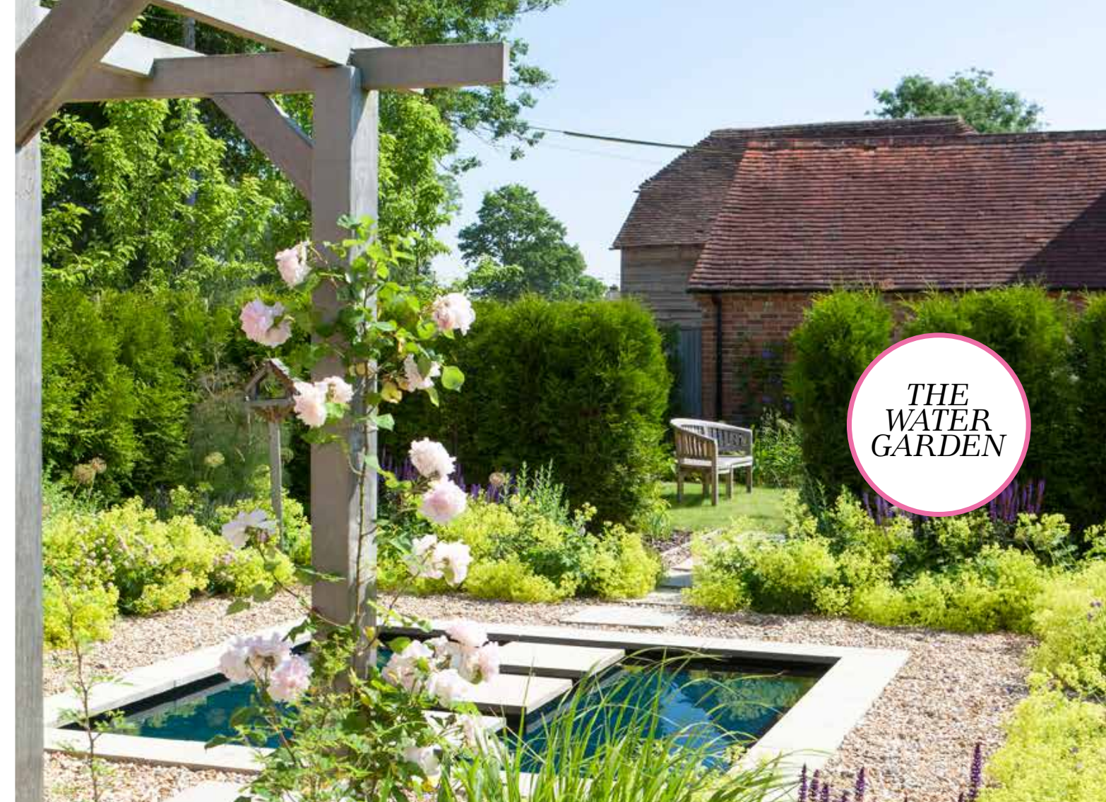
THE WATER GARDEN