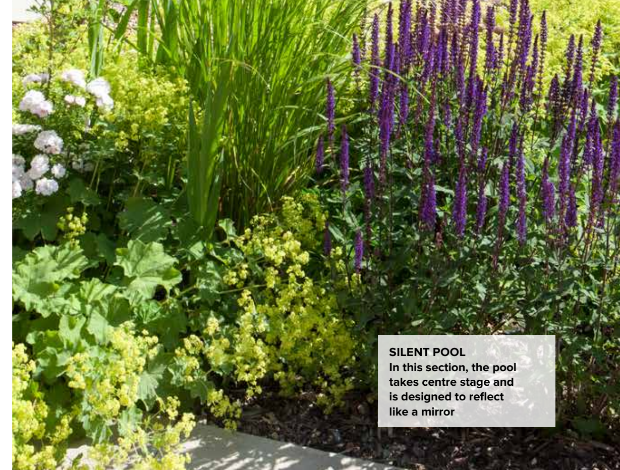
SILENT POOL In this section, the pool takes centre stage and is designed to reflect like a mirror