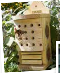
Perfect for attracting birds: Bird nesting box, £5, wilko.com

Not only are they lovely to look at, but bringing wildlife into the garden will combat pests such as aphids, red spiders, mites and thrips. And bees will pollinate the flowers while collecting nectar.