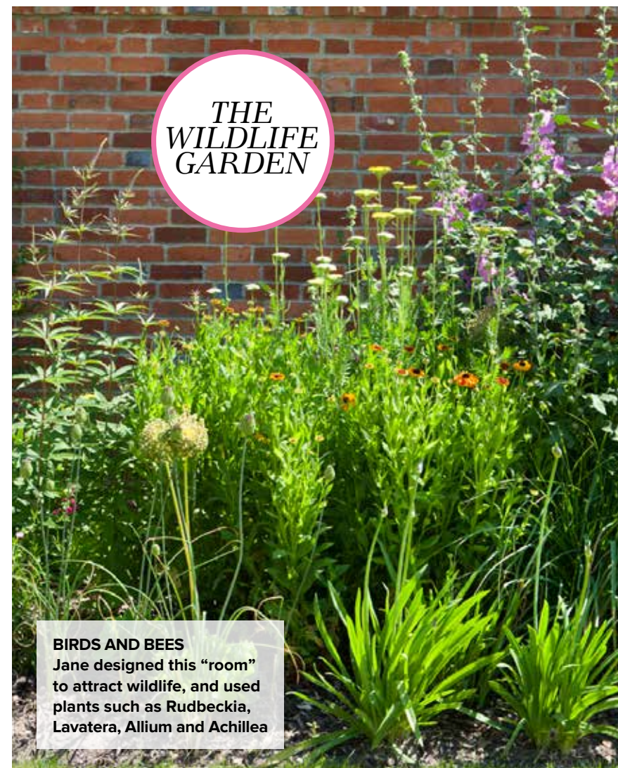
BIRDS AND BEES Jane designed this "room" to attract wildlife, and used plants such as Rudbeckia, Lavatera, Allium and Achillea