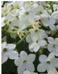
Nicotiana glauca white